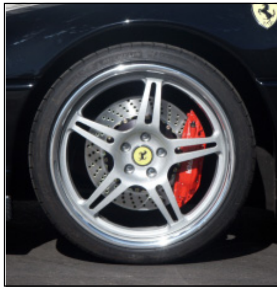
shown with 19" wheel

Note: all kits come with caliper brackets, hardware, and brake lines. Caliper colors include black, red, silver and yellow. Ferrari logos available at extra cost.